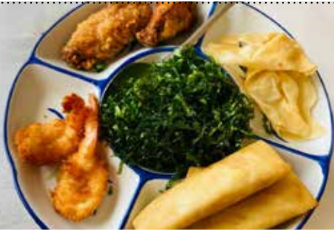
1. FIVE DELIGHT STARTERS 12.25 (Spring Rolls, Butterfly King Prawns, Chicken Entremeses 5 estrellas