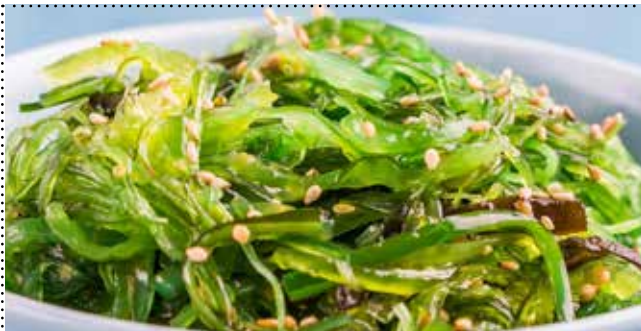
9. FRESH JAPANESE SEAWEED SALAD 6.50 Ensalada de alga