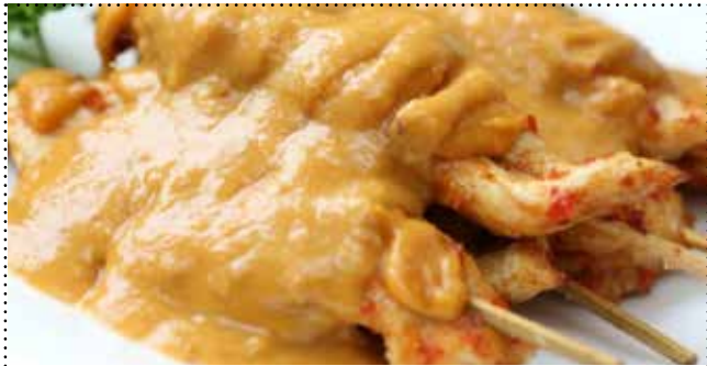
11D. CHICKEN SATÉ ( 4 STICKS) 9.95 Pollo con salsa de cacahuete