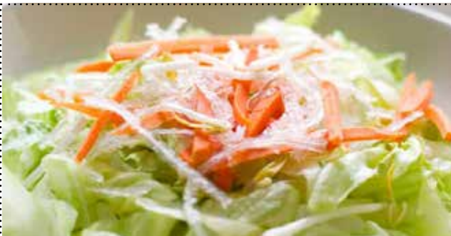
152. CHINESE SALAD 5.75 Ensalada China