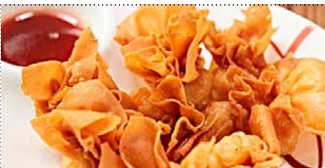
9. FRIED WAN-TAN HONG-KONG STYLE 6,00 Wan-tan frito