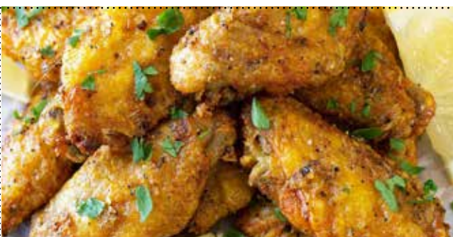
7A. SALT AND PEPPER CHICKEN WING 8.95 Alitas de pollo con sal y pimienta