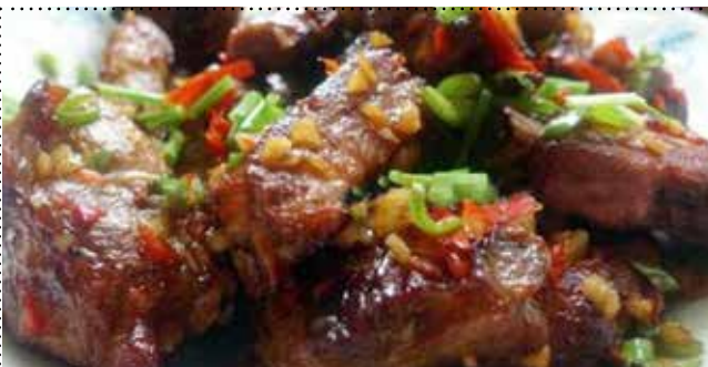
11C. SALT AND PEPPER SPARE RIBS 9.95 Costillas con sal y pimienta