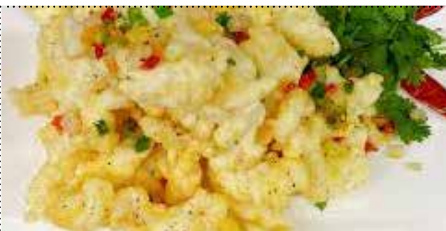
5A. SALT AND PEPPER SQUID 10.95 Calamares con sal y pimienta