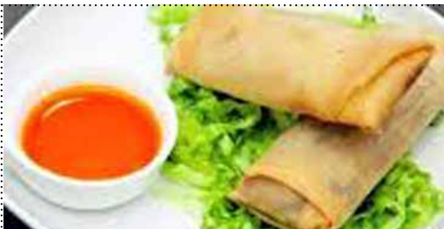
10. SPECIAL SPRING ROLLS HONG-KONG STYLE (x2) 3.95 Rollitos especles