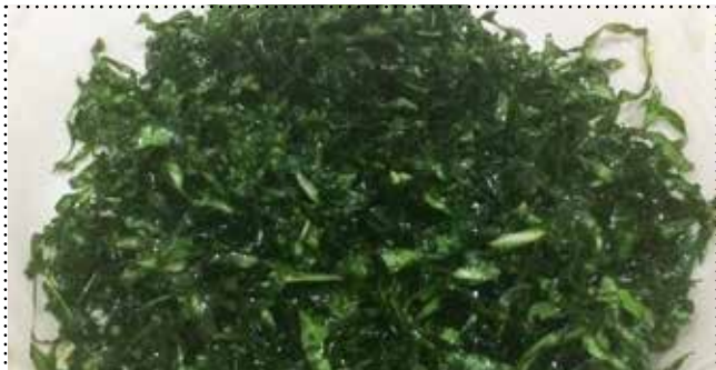
8. CRISPY SEAWEED 6.00 Algas fritas