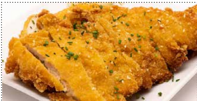
S2. CRISPY CHICKEN WITH SESAME SEED 9.95 Pollo crujiente con sésamo