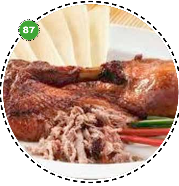
87. CRISPY AROMATIC DUCK WITH PANCAKES .....21.95

( CUT OR SHREDDED ) HALF ( SERVED WITH PANCAKES, CUCUMBER, SPRING ONION AND HOISIN SAUCE ) Pato crujiente con crepes