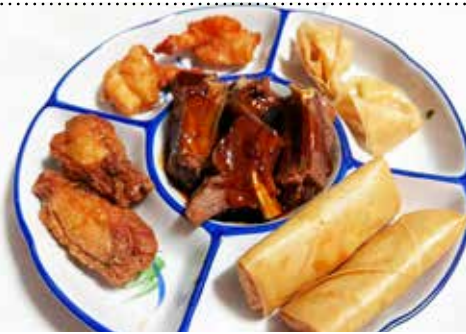
3. ROYAL STARTERS 15.95 Entrante Royal