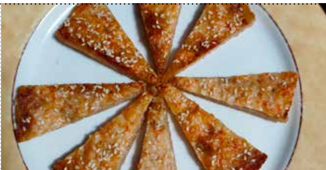
11. SHREDDED PRAWNS ON TOAST WITH 9.95 SESAMÉ SEED Tostadas de Gambas