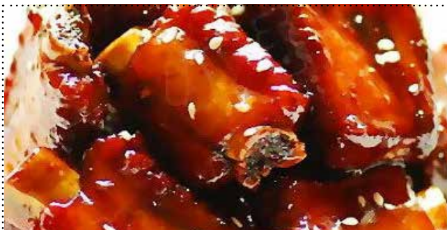
11B. SPARE RIBS WITH BARBECUE SAUCE 9.95 Costillas con salsa de barbacoa