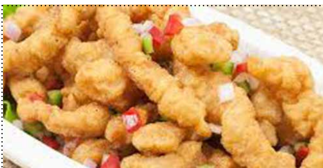
7. CRISPY CHICKEN WITH SALT AND PEPPER 9.75 Pollo crujiente con sal y pimienta