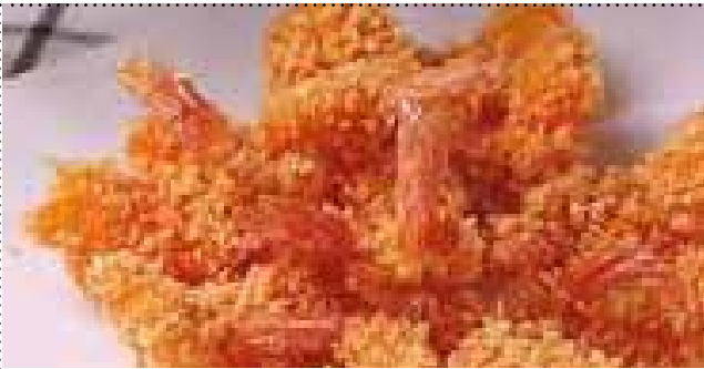
S1. FRIED BUTTERFLY KING PRAWNS 11.95 Langostinos fritos