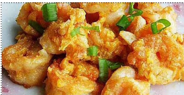
5. SALT AND PEPPER PRAWNS 11.95 Gambas con sal y pimienta