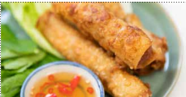
55. CRISPY VIETNAMESE SPRING ROLLS (x3) 6.95 Rollitos estilo Vietnam