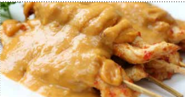
11E. PRAWN SATÉ (4 STICKS) 12.95 Gambas con salsa de cacahuete